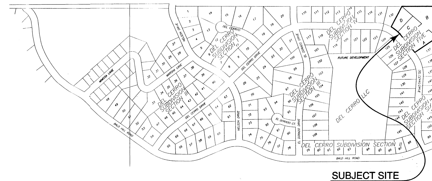
LOCATION MAP 1"=400'