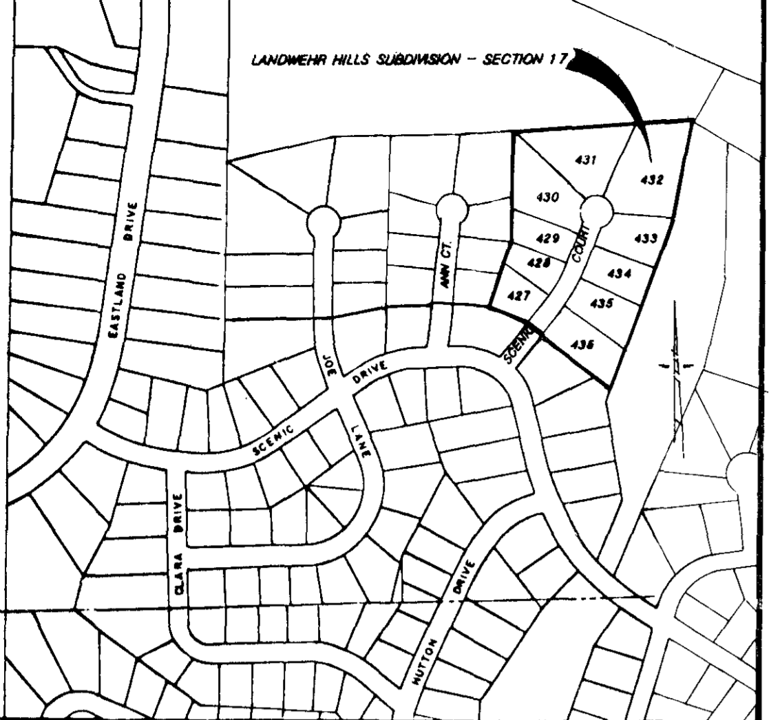
LOCATION SKETCH 1" = 400'